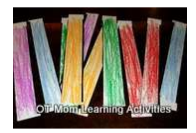
Color the lines before cutting out, to add brightness to your child's creation.

Here are some suggestions for decorating the templates before cutting them out: