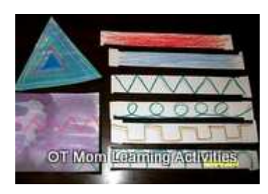
Your child can also practice handwriting patterns before cutting out.

Use the tripod fingers for an extra fine motor challenge.