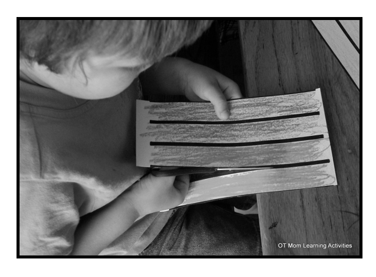
By Tracey le Roux BSc (OT)